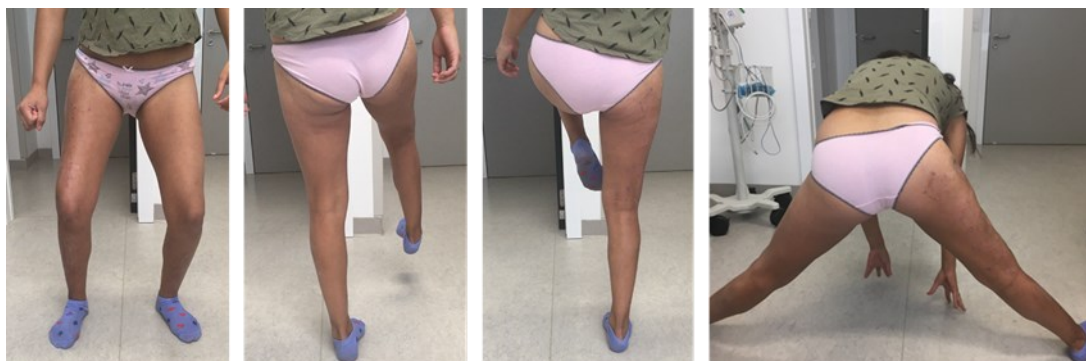
Figure 4: Mobility after external fixator removal, removal at 15 years old.

With these clinical and radiological evaluations, a pelvic support osteotomy was planned and performed at the age of 15 (figure 3). The fixator was removed 10 months after surgery, and her LLD was compensated. Trendelenburg and hip mobility were improved, allowing her to perform daily living activities and sports without pain (Figure 4).