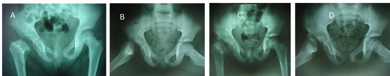
Figure 1: Pelvis radiography anteroposterior (A) and Lowenstein (B) at 4 years. Shows the difference after Dega Osteotomy with pelvis radiography anteroposterior (C) and Lowenstein (D), after 3 years of follow up.

At the time of her referral, she was 4 years old, she complains of coxalgia with mild effort such as walking two blocks, but not at rest or at night, but in instrumental activities of daily living (IADL) she was unable to perform physical and recreational activities, for example, riding a bicycle. In the initial physical examination, she presented: claudication, positive Trendelenburg of the right hip, abduction 10°, internal rotation 20°, flexion 100° and a LLD of 20 mm. The simple anteroposterior hip X-ray and Lowenstein show a completely compromised femoral epiphysis, with a small anterolateral cartilaginous vestige, acetabular deficit, and subluxation (Figure 1 A and C). MRI verifies what was shown in the x-ray (Figure 2).